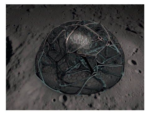
Moon: Origin Point