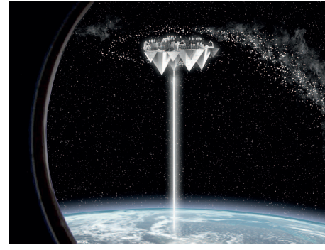
Neck of the Moon