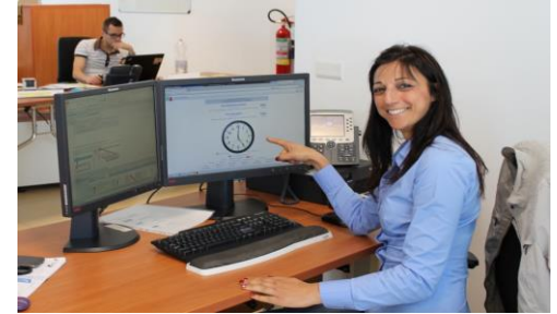
ICC supports sustainable human development with ICT service delivery to UN programmes, funds and entities.