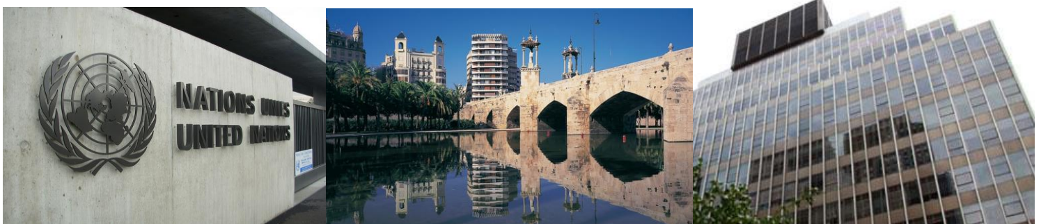
ICC is located in Geneva, Switzerland, Valencia, Spain and New York, USA (pictured above) as well as Rome and Brindisi, Italy